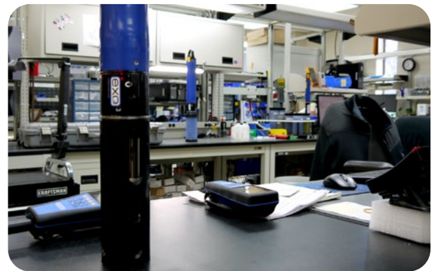
Factory Service Center located in Yellow Springs, Ohio

YSI Incorporated 1725 Brannum Lane Yellow Springs, OH 45387